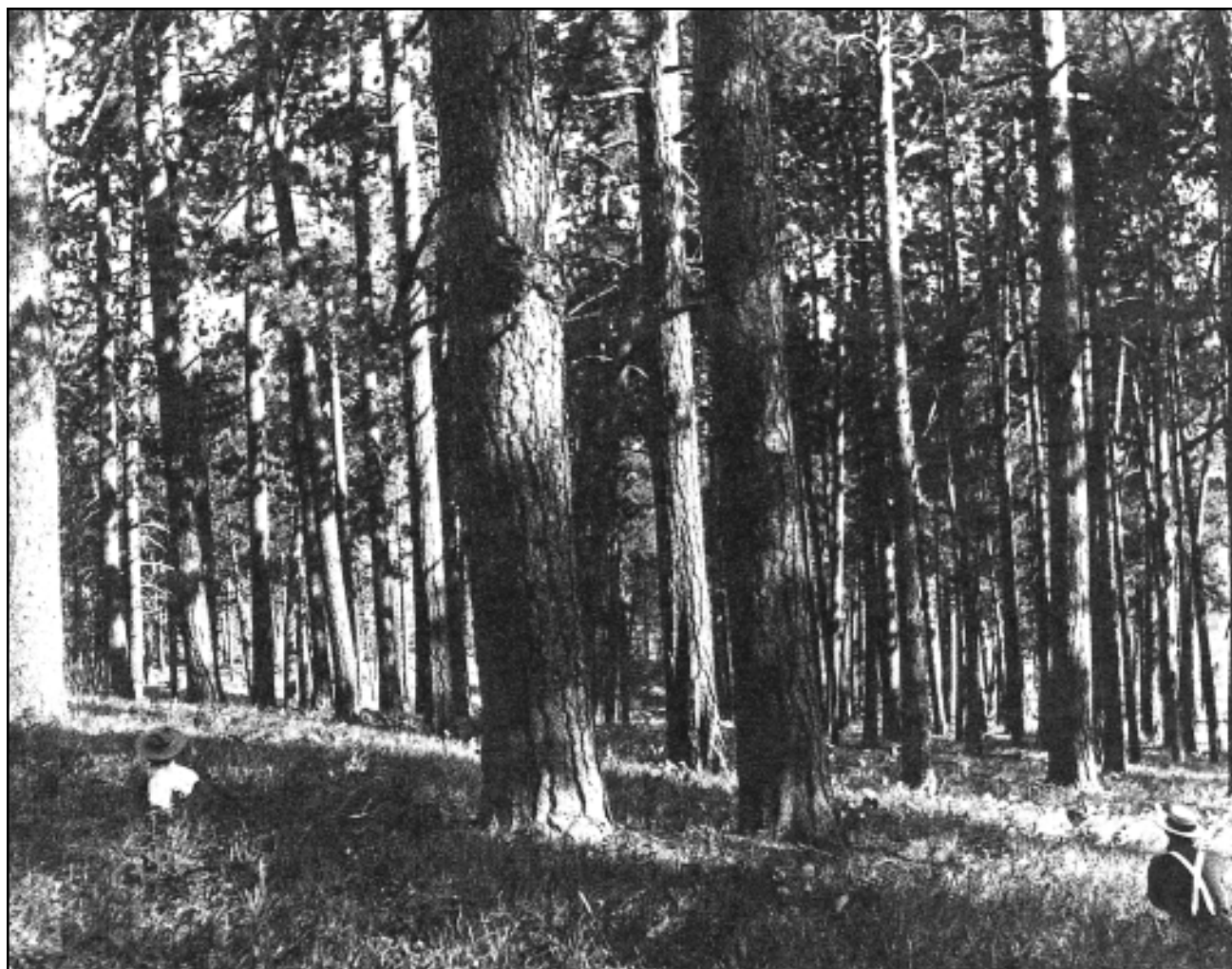
Historic Lick Creek forest conditions, shown in 1909, immediately before partial cutting.

Omitted is an available 1909 photo of the “heavily stocked” Lick Creek forest “immediately before partial cutting,” as shown immediately below (USFS 1995 and 1999):