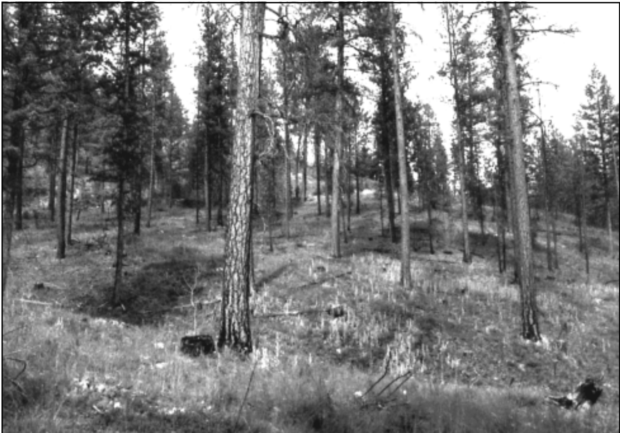
The results of recent Lick Creek "ecosystem management treatments" intended to return the forest to fictitious historic conditions.

It's updated poster "88 Years of Change in Ponderosa Pine Forest" (shown on the title page of this report) furthers the deception by adding a 1997 photo of the results of "ecosystem management treatments," as shown in the photo immediately below (USFS 1999), which compares nicely to the widely-spaced ponderosa pine trees shown in the post-logging 1909 photo: